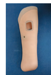
Wrist disarticulation inner socket