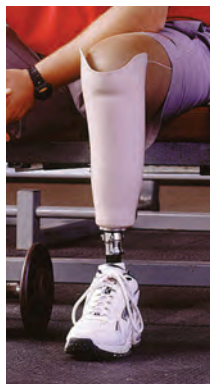
Transfemoral PTB socket with locking pin suspension