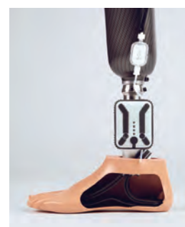
Harmony® e-pulse transtibial vacuum system

With pure suction , precise socket fit enables residual limb skin to remain in full contact with the socket wall