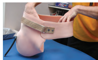
Short transfemoral liner with waist belt

A suprapatellar cuff, which encircles the thigh over the femoral condyles and attaches to the socket with straps, may be a good choice for transtibial patients who have good knee stability. It is normally used