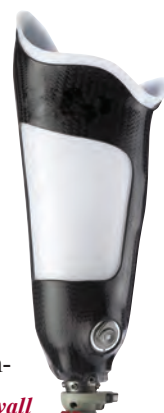
Double wall transfemoral socket

A hydrostatic weight-bearing socket is a specific version of the TSB design, cast in a compression environment to achieve uniform pressure distribution across residual limb tissues. This design encourages tissue elongation within the liner, increasing padding at the distal residual limb and reducing potential for skin breakdown.